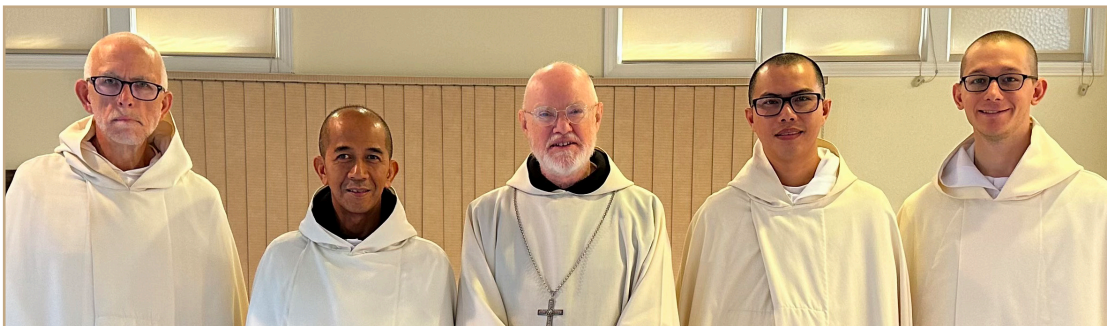
Novices with Abbot (left to right)

place in the Chapter Room, where monks are formally received into the monastic community. As novices, they undergo further training in the observance of the Rule under the guidance of the novice director, teaching of the abbot, and learning to love Christ above all.