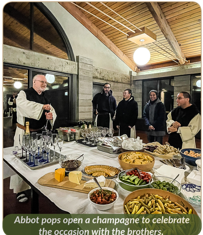
Abbot pops open a champagne to celebrate the occasion with the brothers.