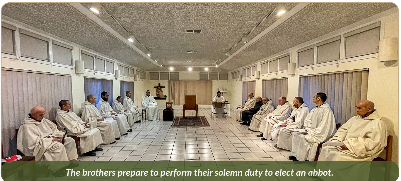
The brothers prepare to perform their solemn duty to elect an abbot.