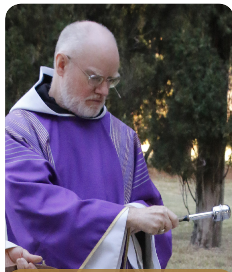
Abbot performs ritual blessing.

divine is anything but routine. Who can define, name, or contain God, the Divine Mystery from which all existence comes into being?