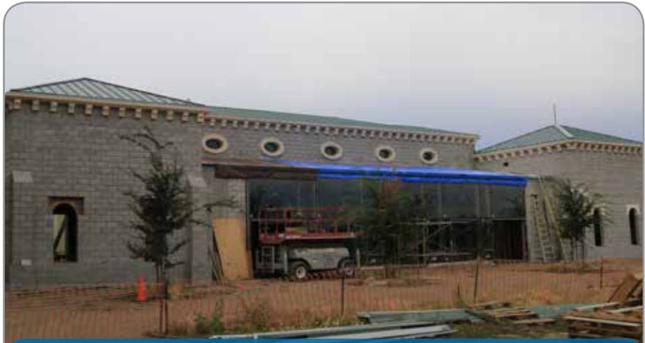
Our new abbey church is seen here with newly installed glass enclosing the gathering space and baptismal font.

This may be what brings visitors to our monastery daily as they seek a place for prayer, quiet, and solitude. Others may come to see a medieval site that holds beauty, history, and culture unable to be found elsewhere west of