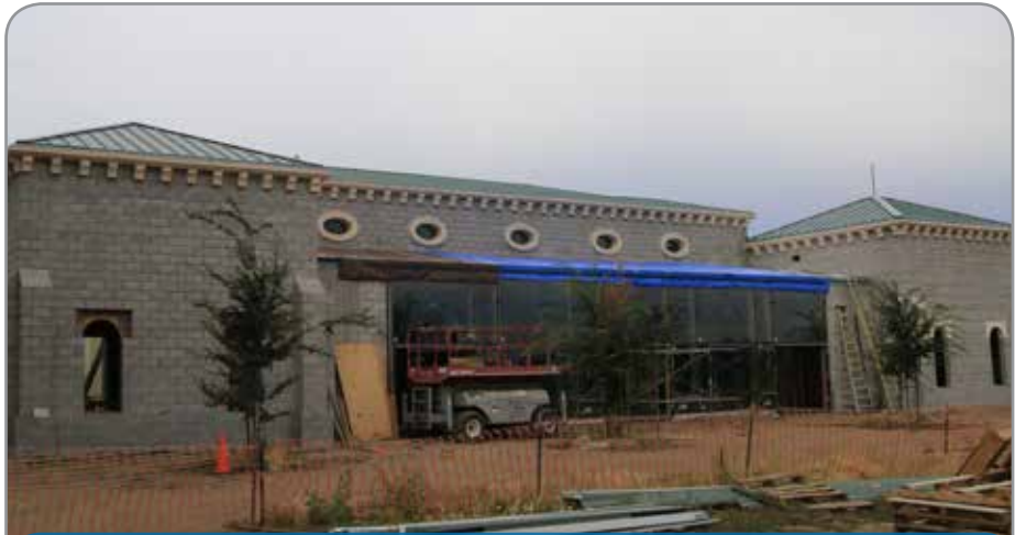
Our new abbey church is seen here with newly installed glass enclosing the gathering space and baptismal font.

This may be what brings visitors to our monastery daily as they seek a place for prayer, quiet, and solitude. Others may come to see a medieval site that holds beauty, history, and culture unable to be found elsewhere west of