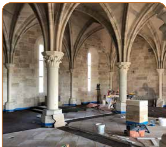
Floor work on the medieval space of our new church.