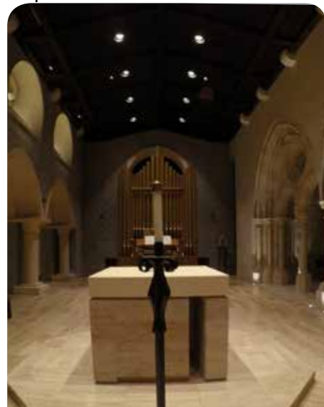
View of the Altar

sins I have confessed. I gladly do the penance because I desire to restore my relationship with God. Therefore, I don't think the idea of penance in itself evokes these