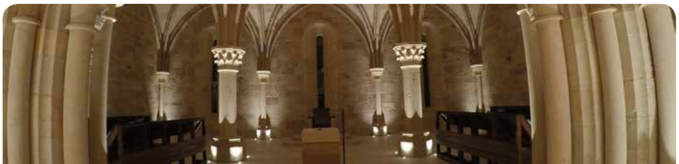
Monks' Choir space (includes choir stalls, ambo and president's chair)