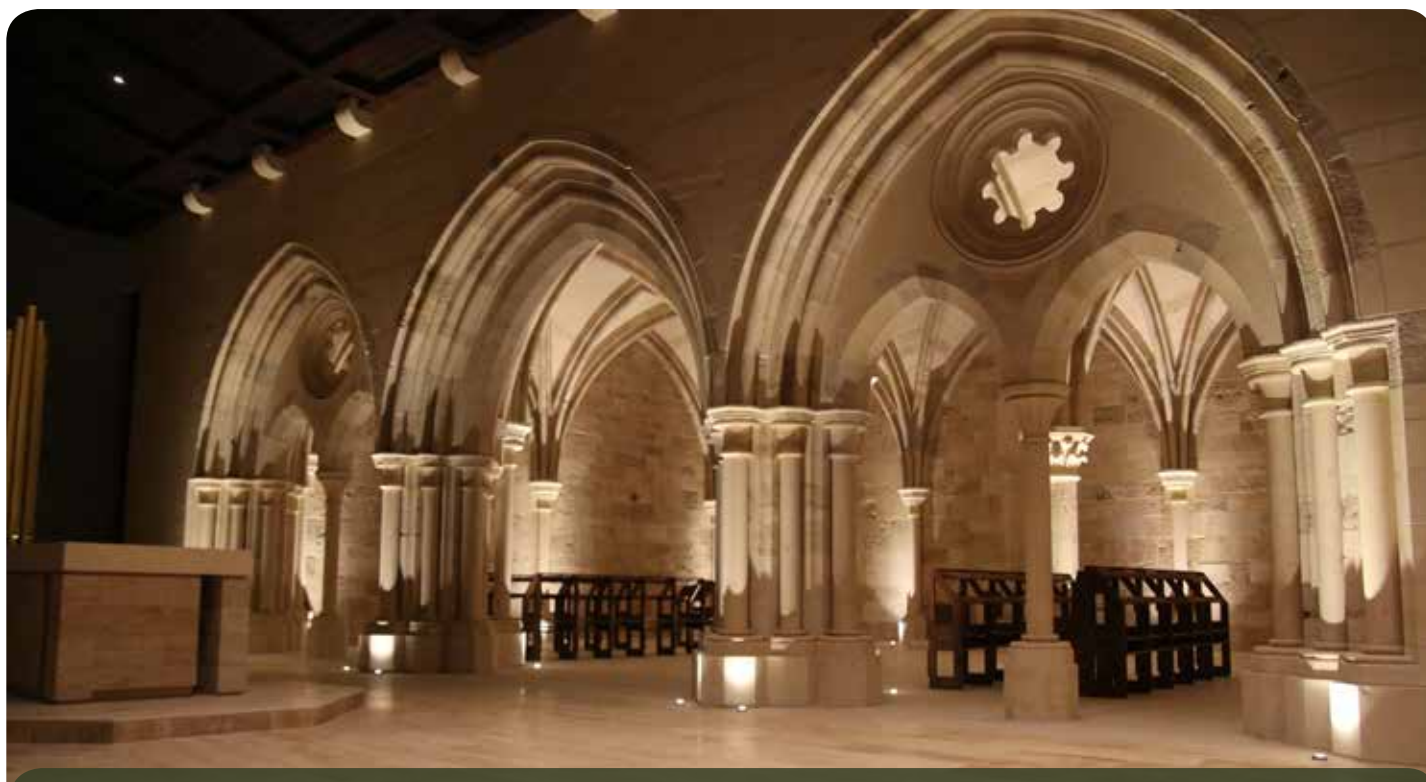
Triple-Arched Gothic Portal Entry